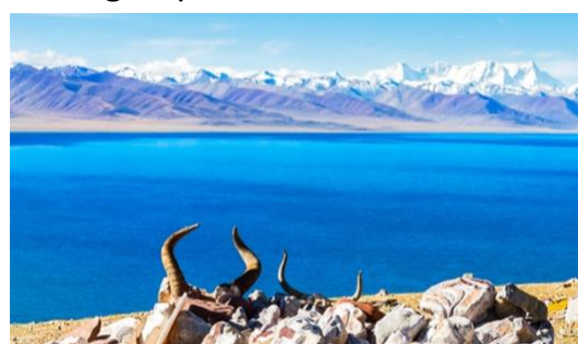
Tibet | Namtso Lake