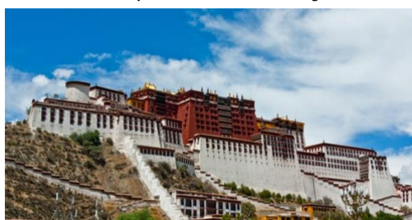
Tibet | Potala Palace