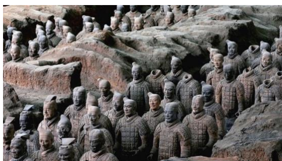
Xi'An | Terracotta Army