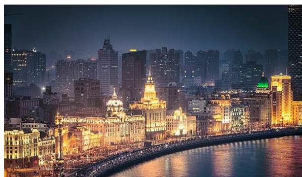
Shanghai | The Bund