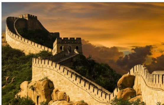
Beijing | The Great Wall

Featuring a selection of iconic attractions