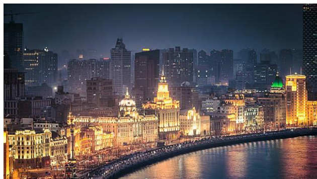
Shanghai | The Bund