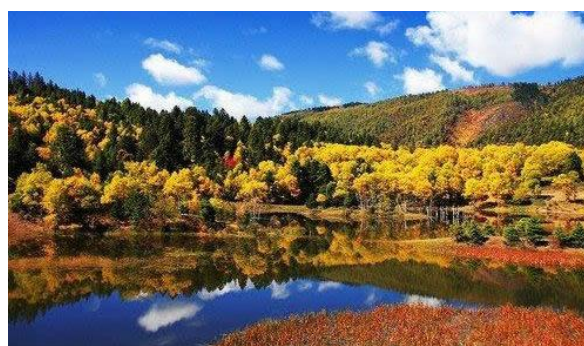
Shangri-La | Pudacuo