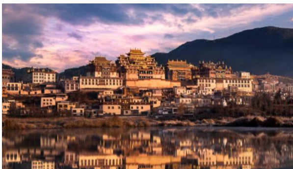
Shangri-La | Songzanlin Monastery