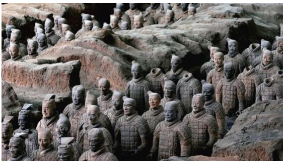
Xi'An | Terracotta Army