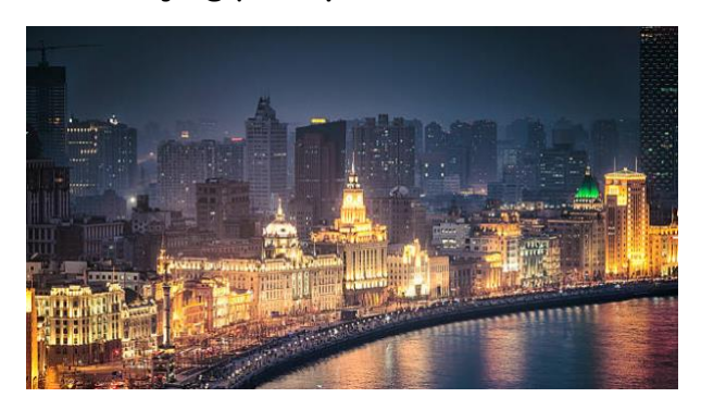
Shanghai | The Bund