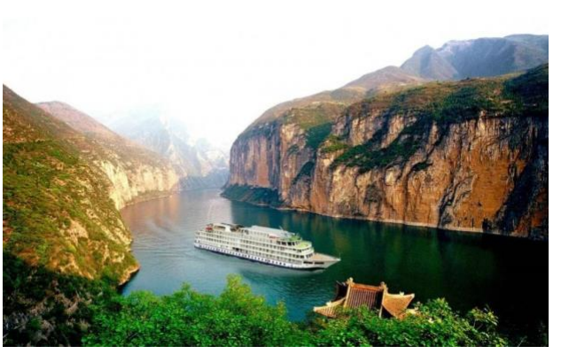
Yangtze River Cruise