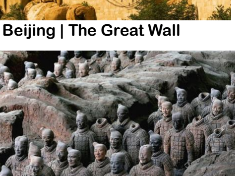
Xi'An | Terracotta Army